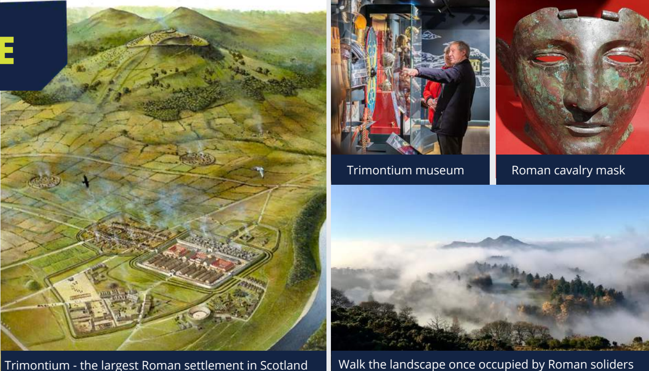
Walk the landscape once occupied by Roman soliders

Prices from: £60 pp Group size: 2-15 Contact: Rob Longworth Trimontium Museum Melrose roblongworth@trimontium.co.uk www.trimontium.co.uk